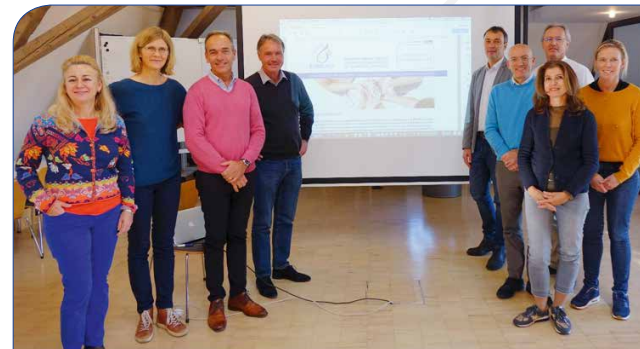
The Founders of the EUBREAST Network holding their kick-off meeting at Esslingen, Germany, in November 2018.

We sincerely thank you for your support!